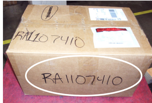
Examples of Preferred Identification (Outer Packaging)