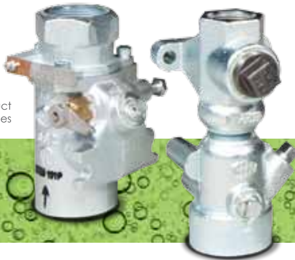
Vapor and Product Shear Valves