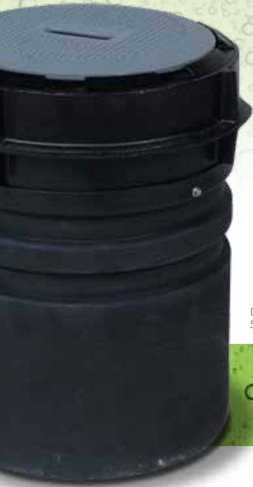
Defender Series™ Spill Containment